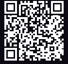
RUT240 360° VIEW

// RUT240 is an all-time bestseller industrial 4G LTE Wi-Fi router for professional M2M & IoT applications.